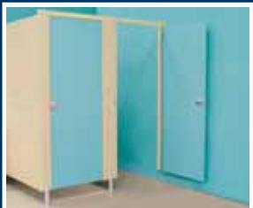
As illustrated with 1 Door Outward Opening 2 of Pack 1 - Hardware; 2 of Pack 2 - Door; 2 of Pack 3 - Partitions